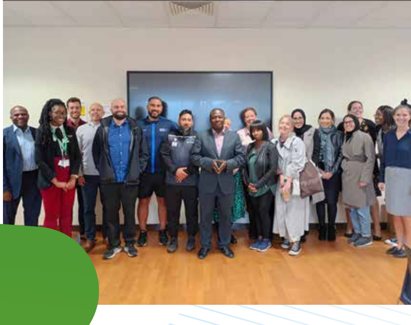
Thank you to all our brilliant Cohort 4 Specialist facilitators for making the NPQ conference an experience that encapsulated the spirit of collaboration.